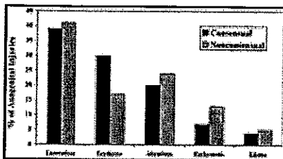
Figure 2. Types of genital trauma documented after consensual (case subjects) and nonconsensual (control subjects) intercourse.

Six hundred twenty-seven anogenital injuries were documented. Figure 2 shows the predominant types of injury, including abrasions, bruising, tissue edema, erythema, and tears or lacerations. The most common type of injury in both groups was lacerations (39% vs. 41%); however, NCSI patients had a greater incidence of anogenital abrasions, ecchymosis, and edema. These differences in the types of injuries were statistically significant ( \chi^2 = 10.4 ; p = 0.035 ). Lacerations were generally seen on the posterior fourchette and fossa, abrasions appeared on the labia minora, and ecchymosis was seen on the cervix and hymen ( Figure 3 ).